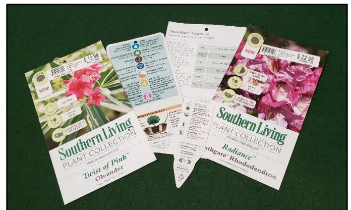
Figure 2. Plant labels provide a wealth of information to help the gardener ensure the success of the plant.

Other information sometimes included on plant labels describe plant care and use. Is it useful for attracting wildlife? Are the plants resistant to wildlife predation? Does it have attractive flowers useful for cutting or attracting butterflies? Does the plant adapt well to container planting? All of these things help you choose the proper plant for your garden. It all comes back to the old adage, "Right Plant; Right Place."