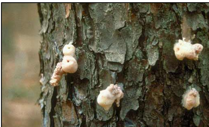
Figure 2. Pitch tubes due to an infestation of Southern Pine Beetles ( Dendroctonus frontalis ).

When bark beetles infest a pine tree, one of the signature signs of infestation is the presence of pitch tubes on the tree bark (Fig. 2). The beetles burrow into the bark in order to reach the nutrient rich cambium tissue. The tree responds by producing rosin (resin/pitch) in attempt to seal the wound and possibly push the beetle out. The rosin may accumulate around the insect's entry point and even run down the outside of the tree.